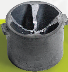
US Patent No. 11,224,933 B2

Our cutting tools are manufactured with certified tool steel that is heat treated for added strength and durability. A special coating process produces carbide surface hardness, while additional coating materials enhance lubricity, durability and performance.